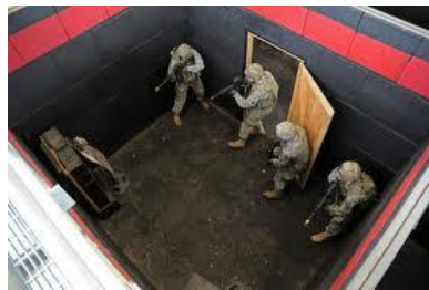
Soldiers practice room entries.