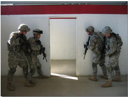
A four-man team prepares to enter the shoot house corridor.

The Fort Devens Automated Shoot House is a fully recorded facility that provides units with a place to train and evaluate individual Soldiers and squads on tasks necessary to move tactically, engage targets, conduct breaches, and practice target discrimination in a live-fire environment.