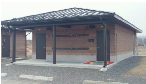
After-Action Review Building

The AAR Theater contains the primary equipment and software used to record exercises in the Shoot House. Theater equipment includes a projector for displaying live action and recorded audio/video of exercises conducted in the Shoot House. The theater equipment is also used for conducting After-Action Reviews and producing a DVD Take Home Package.