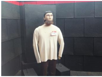
Human Urban Target

The Shoot House is equipped with 10 Human Urban Targets (HUTs). The HUT unit is equipped with mortal and non-mortal hit sensing capabilities, and visual response to a kill shot. Available options include adding motion detecting devices, Multiple Integrated Laser Engagement Systems (MILES) Shoot back capability, and MILES interface kill feature.